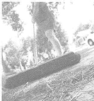
(Some information cited from: Jerry Spetzman, MN Department of Agriculture)

See the City of Andover website and check out the following website for great information on water quality information: www.cleanwatermn.org